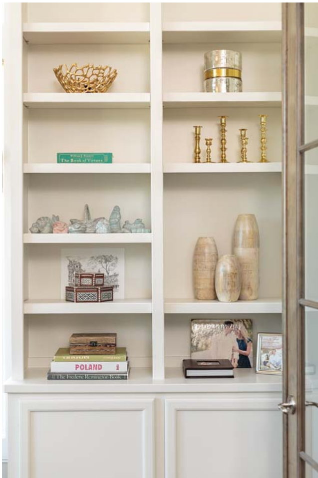
Here we grouped our client's brass candlesticks to create a fun vignette.